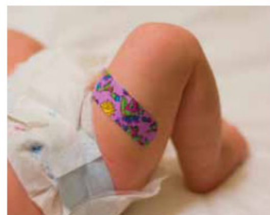
The new vaccine is expected to protect infants and young children against invasive pneumococcal disease and acute otitis media.

As well as protecting against IPD, it is also expected to be effective against AOM, the incidence of which peaks among children aged 6 to 18 months, and for which at least half of cases are caused by pneumococcal bacteria.